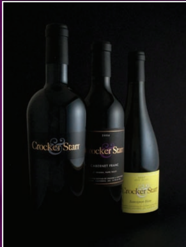
Delicious Crocker & Starr wines!

Crocker & Starr Wines 700 Dowdell Lane St. Helena, CA 94574 (707)967-9111 www.crockerstarr.com